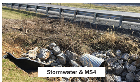
Stormwater & MS4