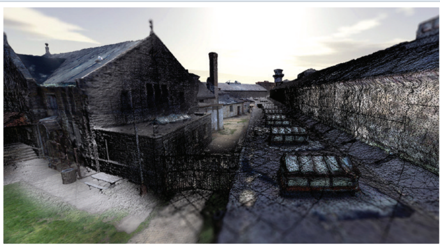
Reality Modeling of Eastern State Penitentiary, Philadelphia